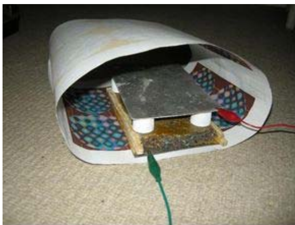
Fig. 1. Set-up for sending frequencies non-locally: flat piece of orgonite between two metal plates (to which frequencies are applied) surrounded by printed copy of the chosen image.

For this purpose I have used a small Rife instrument (8). The leads, which would normally be connected to sticky skin-contact pads, were connected to two zinc plates. (aluminium was avoided because it blocks the passage of the subtle energy field). For non-local transmission a flat piece of orgonite, made with steel wool and resin as above, was placed between these plates, and the whole surrounded by the printed image, face inwards (Fig. 1). This image was chosen as the one, out of several tested, which performed best in dowsing tests for non-local entanglement (7).