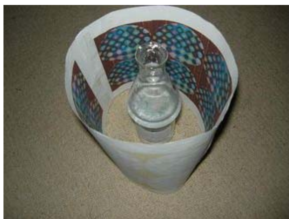
Fig.2. Receiving set-up: another printed copy of same image as in Fig. 1 surrounds flask containing 50% DSS, and 2-300mg solid MP.

At maximum setting the Rife instrument puts out about 36V, making an electrostatic field of about 12V/cm. At the remote site, ~2-300mg of magnesium phosphate (MP) crystals were placed in a flask, surrounded by another copy of the pattern (Fig. 2). After switching on the output, about 40-60ml 50% DSS was added to the flask. To ensure that all frequencies get a chance to be taken up (since the uptake of ormus is so rapid) the Rife was set to cycle repeatedly through all the selected frequencies, allowing only 5sec for each. Although sine waves were used for this test, for therapeutic use square waves, with the very sharp rise time of which this machine is capable, are likely to be more effective.