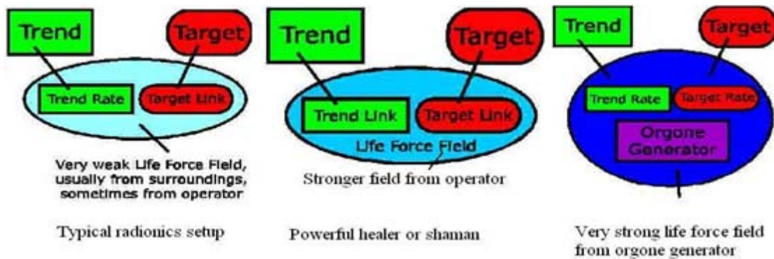
Fig. 5. Rationale for his radionic method by Karl Welz (11). “Target” could be a human patient, and “Trend” would normally be healing. Emphasizes the need for life-energy, or syntropic field - as supplied either by the healer, or by the organite within his device.

In this way one might enable a single short healing session to exert a continuous effect for an indefinite period. Such an idea has of course long been used in radionics. According to Karl Welz, from whose web-site Fig. 5 is copied (11), any healing or radionics requires the syntropic field of the operator, but the role of organite is to greatly enhance this field.